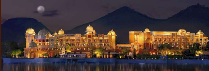
World's Top Hotels and Resorts