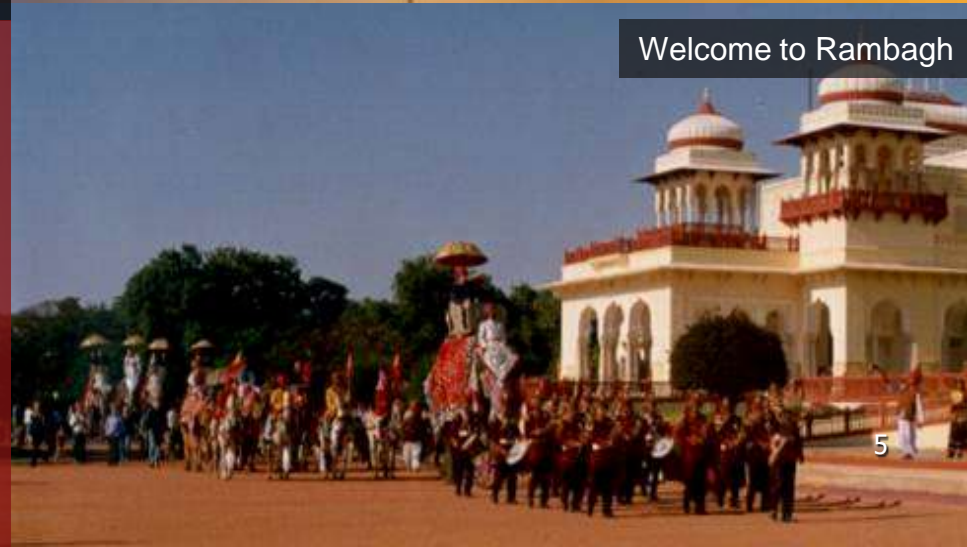
Welcome to Rambagh