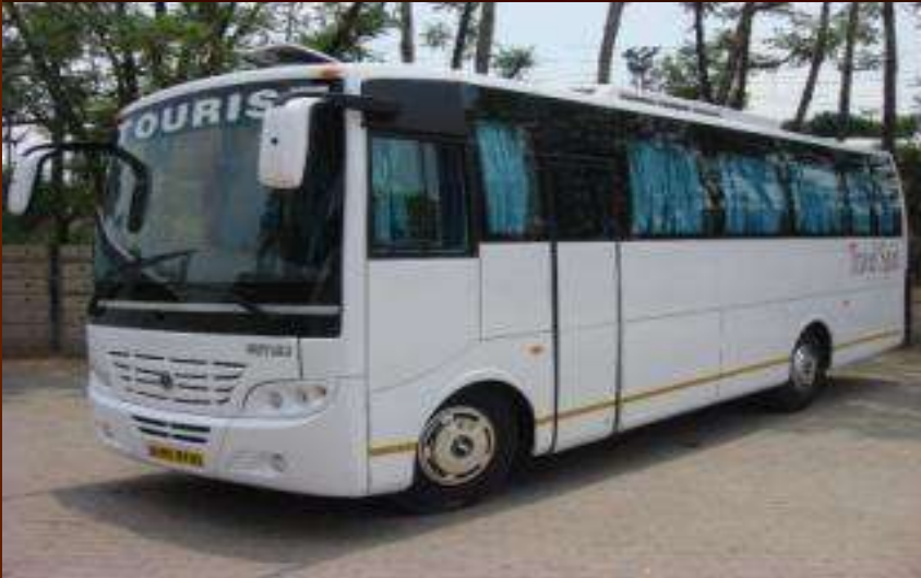
31 Seater Coach