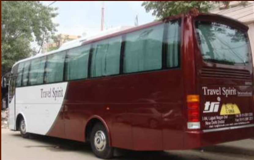
27 Seater Coach