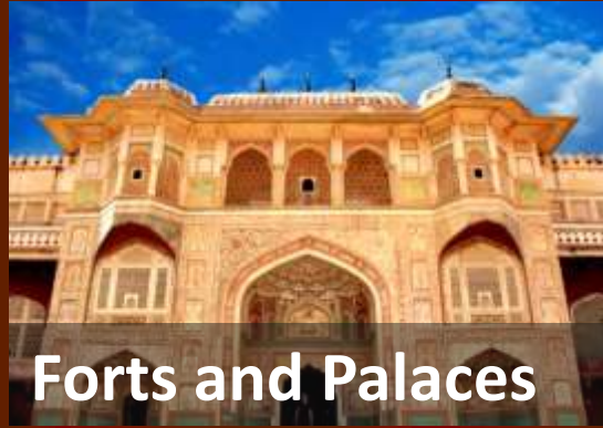
Forts and Palaces