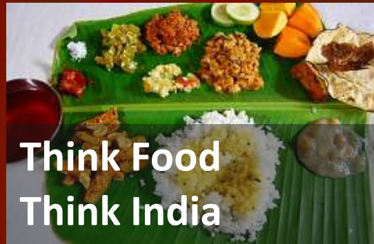
Think Food Think India