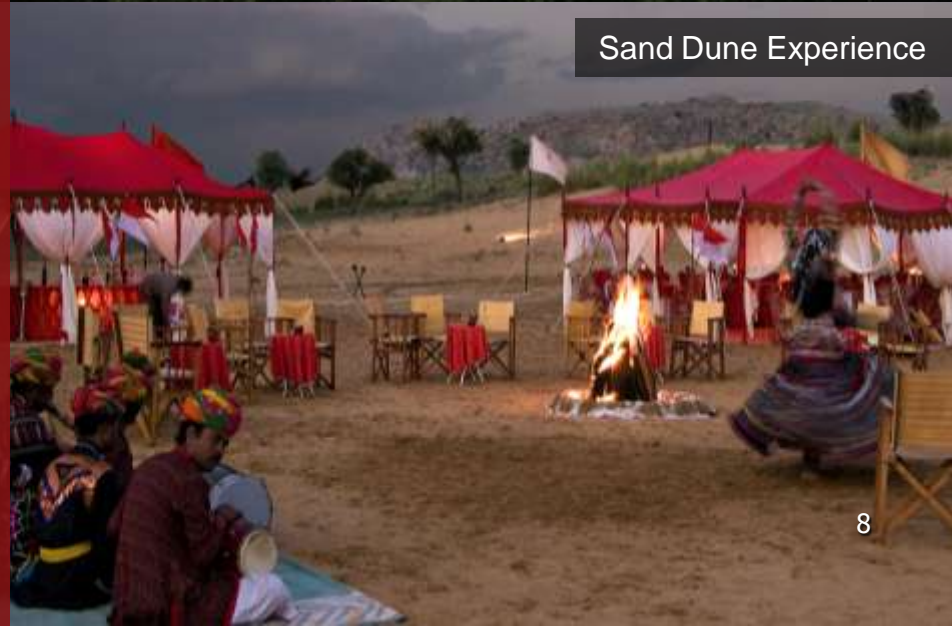
Sand Dune Experience

Overnight in The Leela Palace Hotel. (B,L,D)