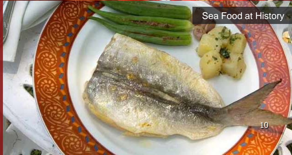
Sea Food at History