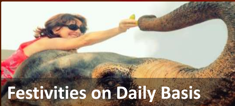
Festivities on Daily Basis