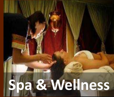
Spa & Wellness