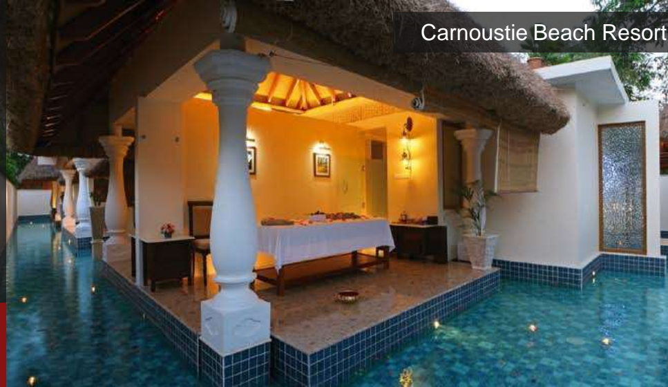
Carnoustie Beach Resort

Fishermen Theme Dinner: A fishermen village setup with local girls in traditional attires and stewards dressed as fishermen folk and various live food counters will be set up with the days catch, graced by live music and dances.