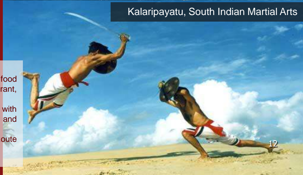
Kalaripayatu, South Indian Martial Arts

Depart for Cochin Airport (80 km/2 hrs) & for your journey onwards